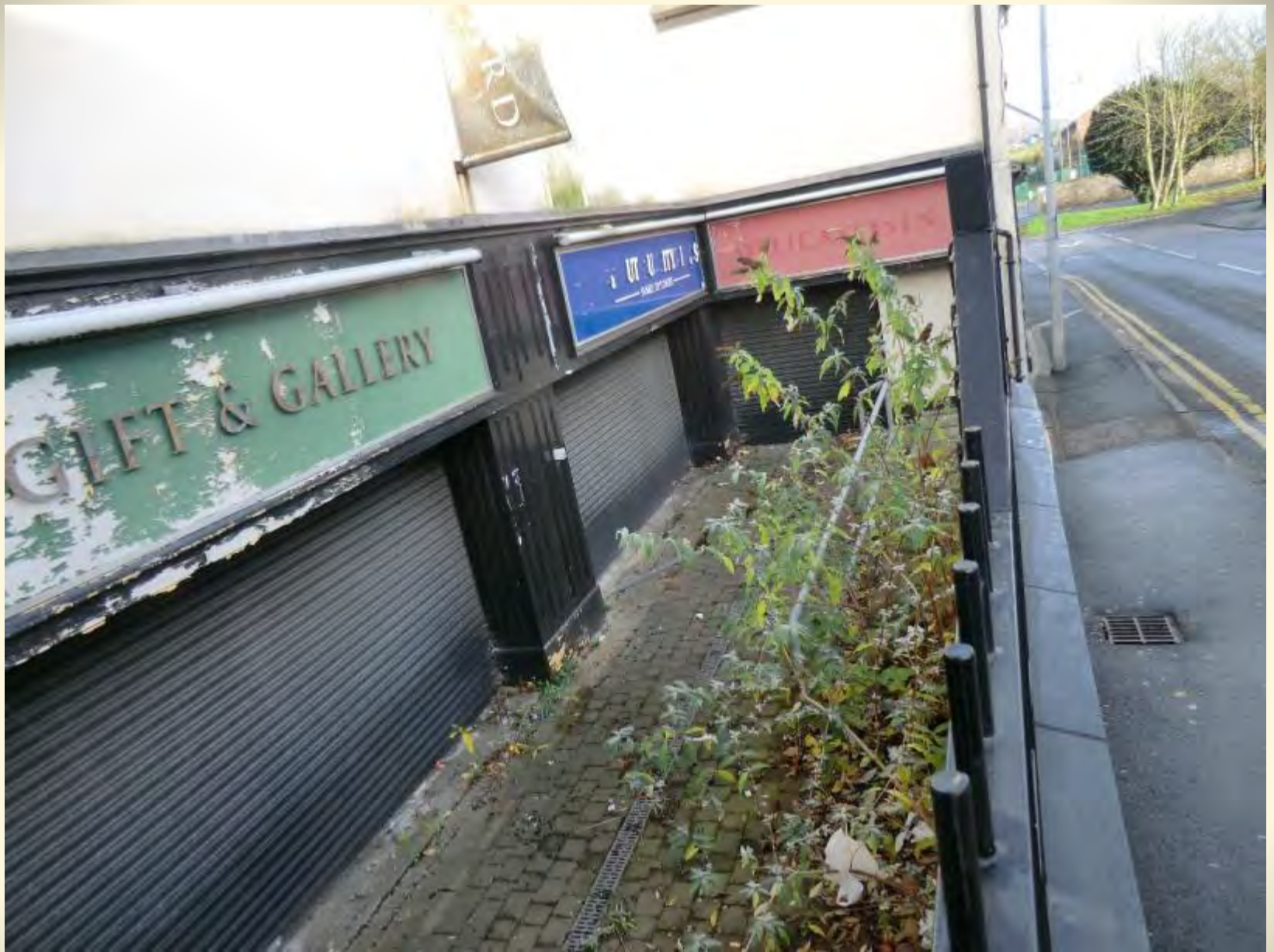
Bridge Street Link