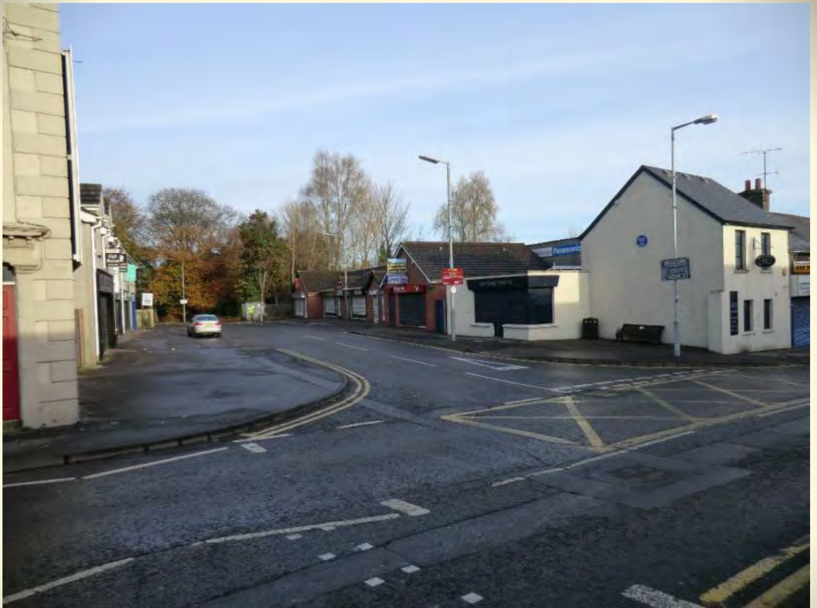
Bridge Street Link